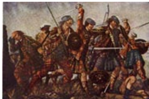
“The Battle of Culloden” by David Morier circa 1745

“Authentic documentation of the tartan previous to the 19th century is limited to a comparatively small number of contemporary portraits, and is negative so far as it provides any suggestion of heraldic significance or ‘clan badge’ intention. In a range of Grant portraits at Castle Grant, no tartan repeats and none has any relationship with the tartan known as Grant to-day. MacDonald portraits of the 1740s to the 1760s show the same person at different ages, wearing in one picture no less than three varying ‘red’ tartans and in the other a ‘green’ tartan, none of them bearing any relationship to the ‘Tartan Book’ patterns.”