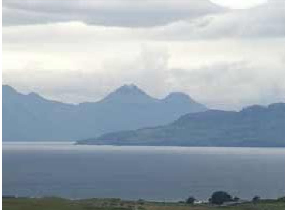
Rhum and Muck, from Ardnamurchan

It is expected no gentleman will step over the rail round the dancing place, but will enter or go out by the doors at the upper or lower end of the room, and that all lady’s and gentlemen will order their servants not to enter the passage before the outer door with lighted flambeaux.’